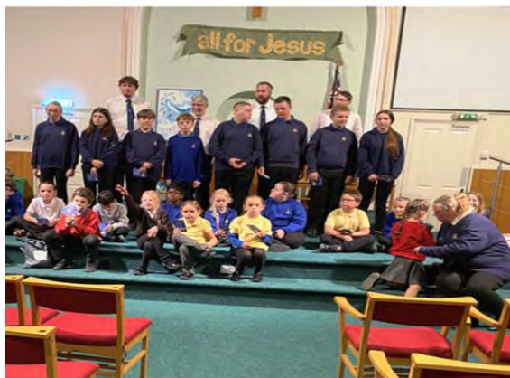
Our Annual Re-Enrolment Service took place on 3 rd October

Our annual Re-Enrolment service took place on 3 rd October, held once again as part of the Friday evening programme, in order to encourage more members and parents to attend. Members were presented with their membership cards for 2025/26, and made their promises to serve as loyal members for the coming year.